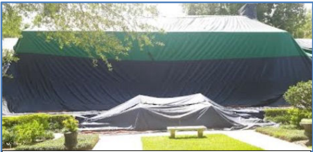
June 2023 Tenting of the Clubhouse

Accolades to our Club Members, Staff, and Community for the many volunteer hours and financial support while we continued to march on, heads held high, throughout 2023. We learned to have patience at every turn; waiting for spring to show us what parts of our beautiful grounds had survived the winter freeze, and again in June following the extensive cutting back and removing lots of vegetation for the tenting of our Grand Old Lady! The good news is, "We've come a long way baby!" Unlike Spring of 2023, 2024 will be filled with projects that were delayed, along with some recently approved (Surprises!!) We will continue to be very good stewards of monies in our Preservation account, and again, thank you to those who continue to be so generous while we address unexpected expenses.