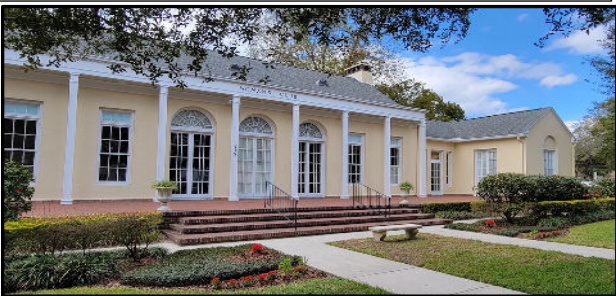
July 2023 WCWP Clubhouse back to normal