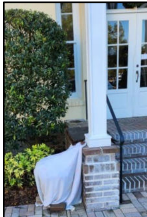
2022 Plants covered for the holiday freeze